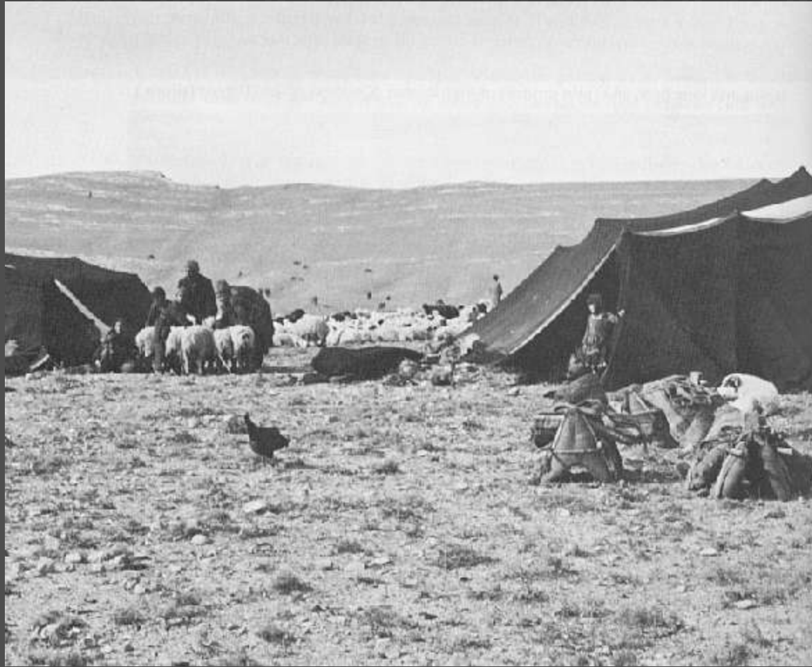
Encampment of nomadic pastoralists near Bojinoord, Iran. The tents are quickly erected and taken down.