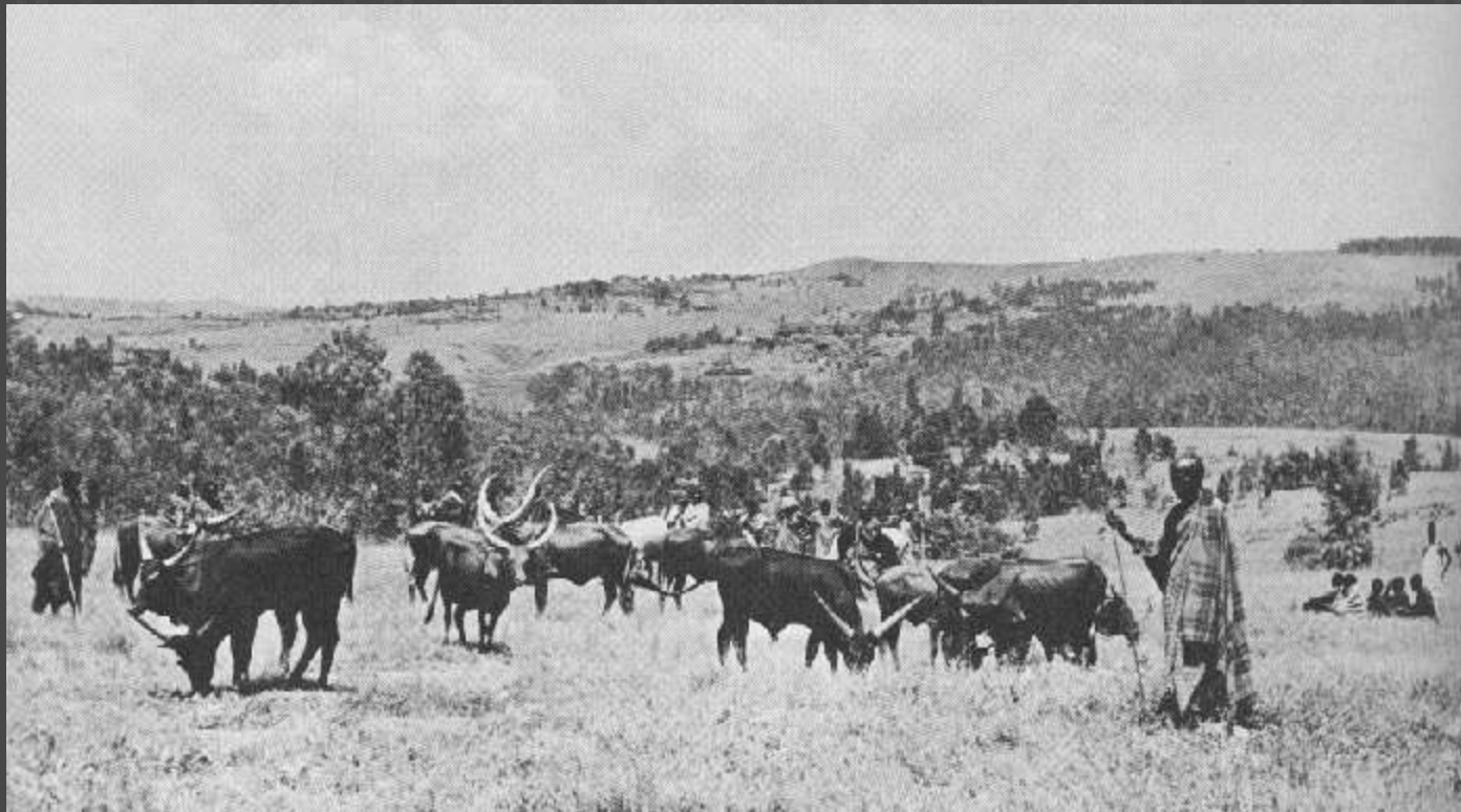
Long-horned African cattle grazing near Kitega, Ruandi-Urundi.