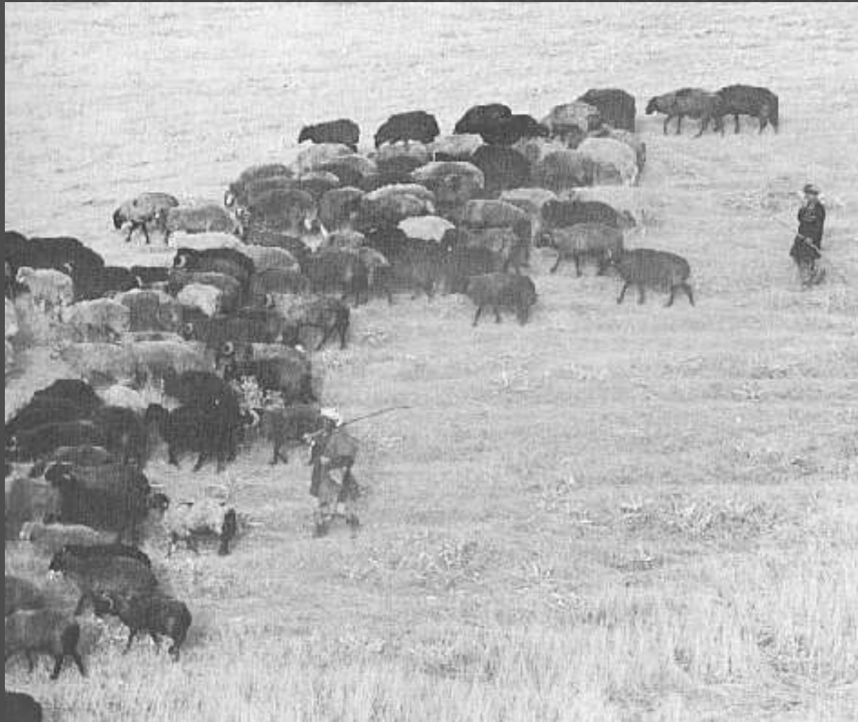
Flock of karakul sheep grazing in northern Afghanistan.