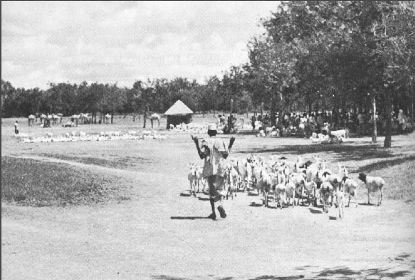
Villa Bruzzi, Somaliland.